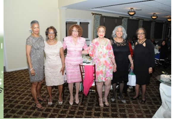
Baltimore Chapter Joins Philly!