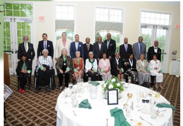
Honorees in their regalia!