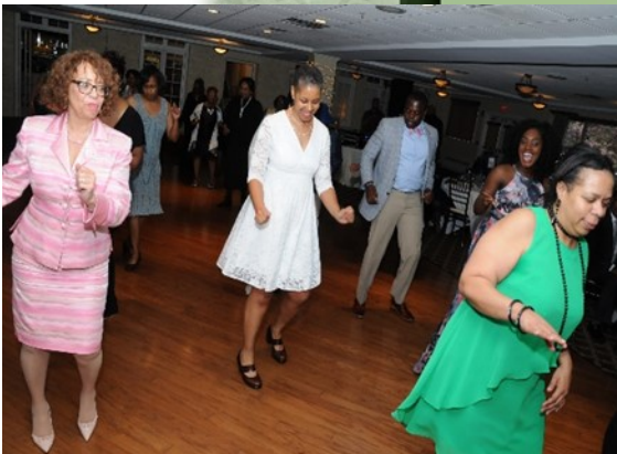
Fun was had by all!!